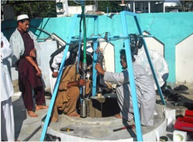
Koz Palao: Communal well in Swat installed 17/8/2011

Koz Palao is in the village of Shalpin located in the mountains of northern Swat. These villagers have acute water problems with long trips to collect water from a hand pumped well. This site was surveyed by UNDP team and considered as one of the most deserving places in this region.