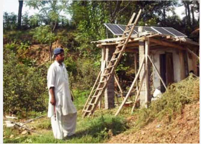
Khapal Kor Foundation: Orphanage in Swat installed 28/8/2011

Khapal Kor Foundation (KKF) was built in October, 1996 to accommodate the orphans of Malakand region. It is located in Swat near to the city of Mingora. The 3,500 orphans residing here are provided with free education and skills development to give them equal opportunities in society. APT team along with the UNDP team surveyed this site on 21/8/2011, the director of KKF was very excited about the solution.